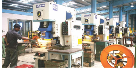
High Speed Presses