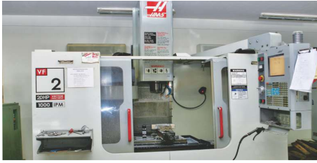
CNC Vertical Machining Centre- HAAS