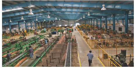
80,000 sq.ft. Shop Floor