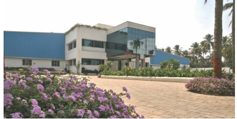
5 Acre Manufacturing Facility